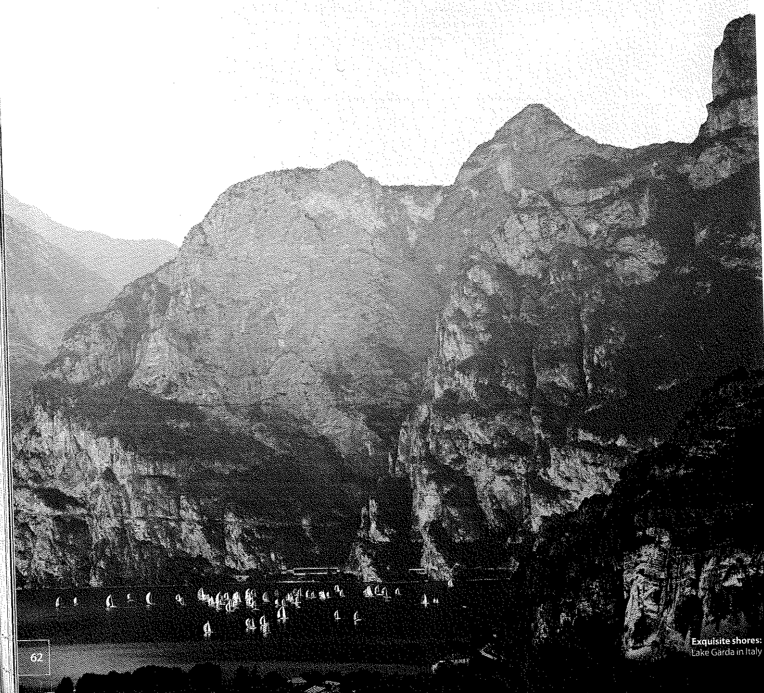
Exquisite shores: Lake Garda in Italy

Restaurant Le Voltaire is at 27 Quai Voltaire (+33 1 42 61 17 49). Paris Convention and Visitors Bureau ( www.parisinfo.com )